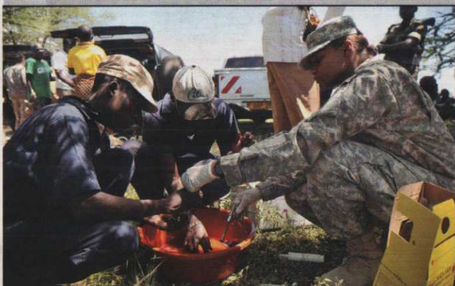
US Forces with Uganda People's Defense Forces.

Our decisive effort is to develop and strengthen the joint, interagency, intergovernmental, and multinational (JIIM) team. CJTF-HOA is creating lasting and meaningful relationships, founded on trust and collaboration with all regional partners to address security threats of shared concern and create an environment that enables continued economic growth, democratic consolidation and sustainable broad based development.