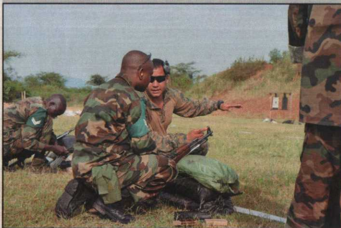
US Forces with Ugandan Soldiers.

The United States of America and CJTF-HOA respect the sovereignty of our East African partners. CJTF-HOA will work with our partners to ensure our actions and movements are in accordance with international norms and the laws of our hosts. CJTF-HOA service members will be good teammates, and accountable and respectful, as we execute missions together.