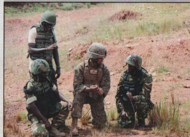
US Forces with Burundian Soldiers.

Combined Joint Task Force Horn of Africa Public Affairs Office www.hoa.africom.mil